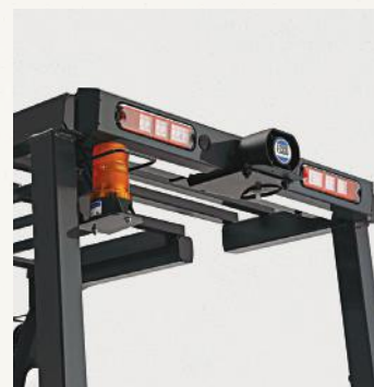
Rear Combination Lights