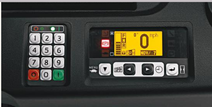
Programmable Performance Parameters