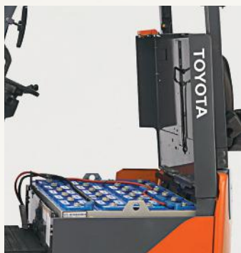
Heavy Gauge Formed Steel Battery Compartment Hood