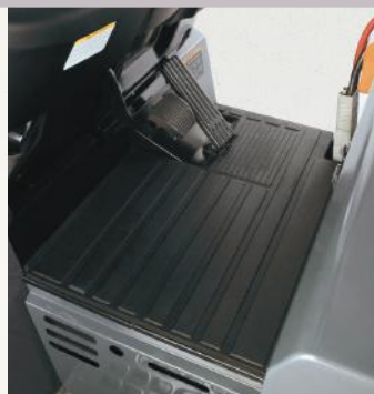
Heavy-duty Non-slip Floor Mat