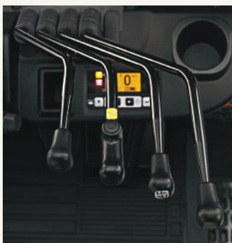
Cowl-Mounted Hydraulic Controls