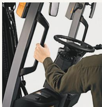
Dual Operator Assist Grips