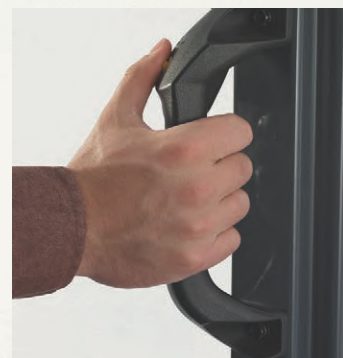
Rear Assist Grip w/Horn