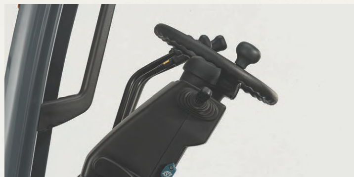
Smaller Steering Wheel

Toyota's sit-down counterbalance design prioritizes comfort and versatility. Controls are designed and positioned for easy access and intuitive functionality, enabling confident control of the forklift in forward or reverse. Add the ergonomic benefits of the smaller steering wheel, foot parking brake, weight-adjustable full-suspension seat and dual-side entry with assist grips. The result? Increased comfort and a more productive experience.